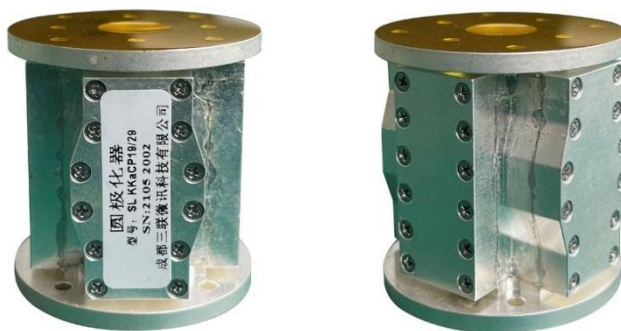
K/Ka band circular polarizer (type B)