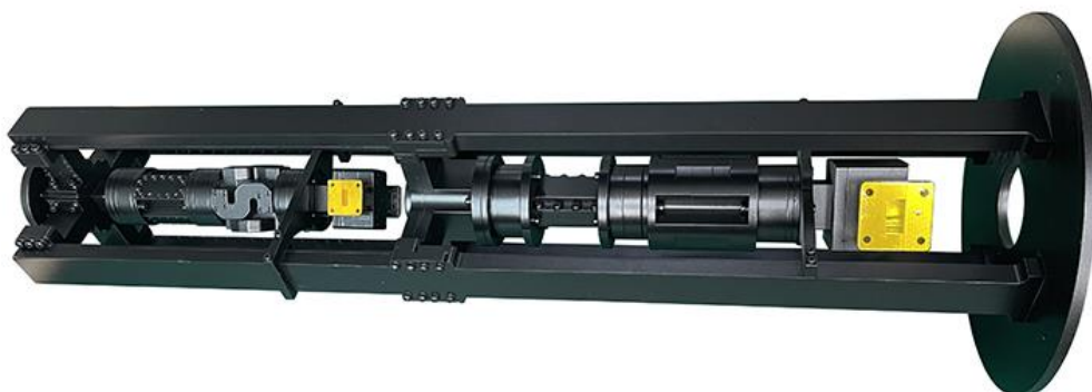
Ku/K LHCP/RHCP/Horizontal polarization/Vertical polarization sub system

Address: No. 18, Chengzhi Road. Chenghua District. Chengdu City. China. 610053 Tel: +86-021-86780908 Email: slwb@vip.163.com