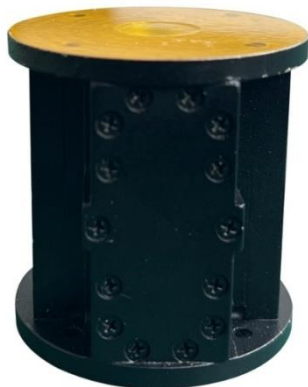
K band circular polarizer