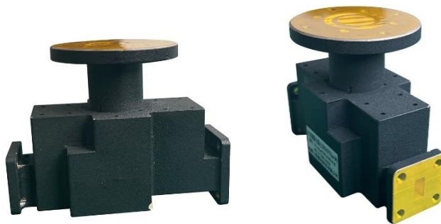
K/Ka band different frequency OMT