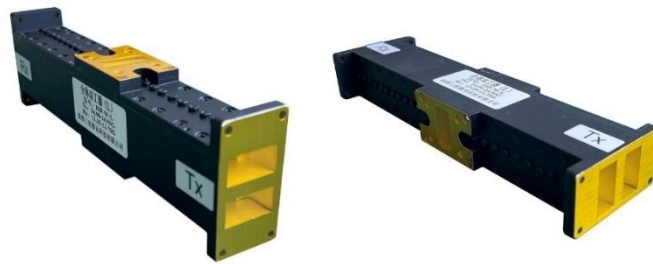
Ku Band Satellite Communication Duplexer